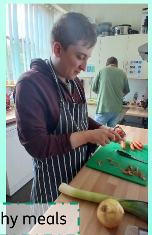
Cooking new and healthy meals