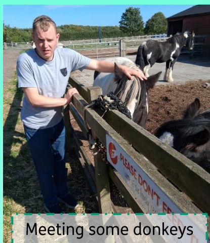
Meeting some donkeys