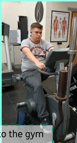
Going to the gym