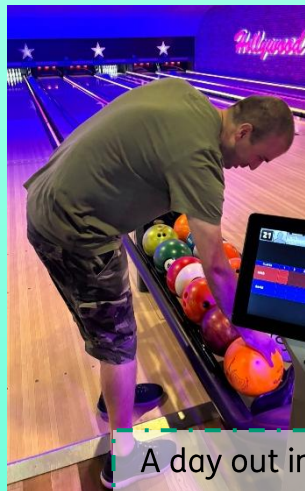
A day out in Norwich