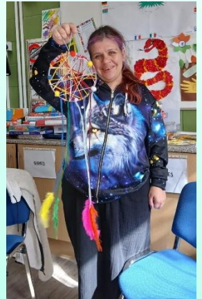
Arts and crafts activities